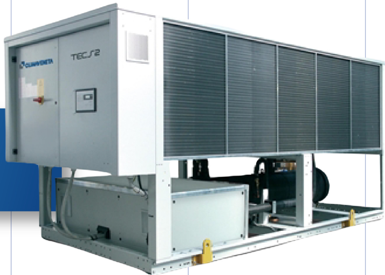
SCREW COMPRESSOR Model TECS2 (66 -336 TR) Equipped with Climaveneta's magnetic levitation technology.