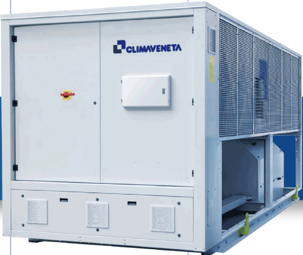
SCREW COMPRESSOR Model ERACS.C (70 - 575 TR) High-efficiency screw chiller that has the latest technology from Italy.