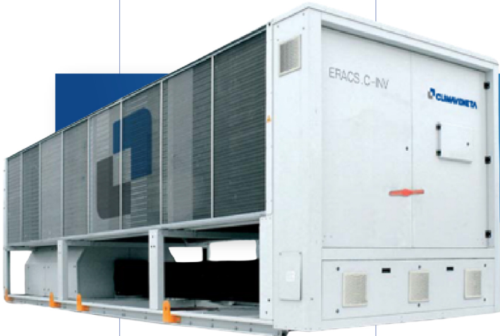
SCREW COMPRESSOR Model ERACS.C-INV (80 - 430 TR) High efficiency screw chiller that has the latest technology from Italy.